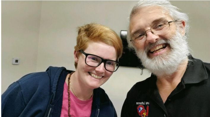
We are currently mentoring 4 seminary students - one 3rd year student and three 1st year students.